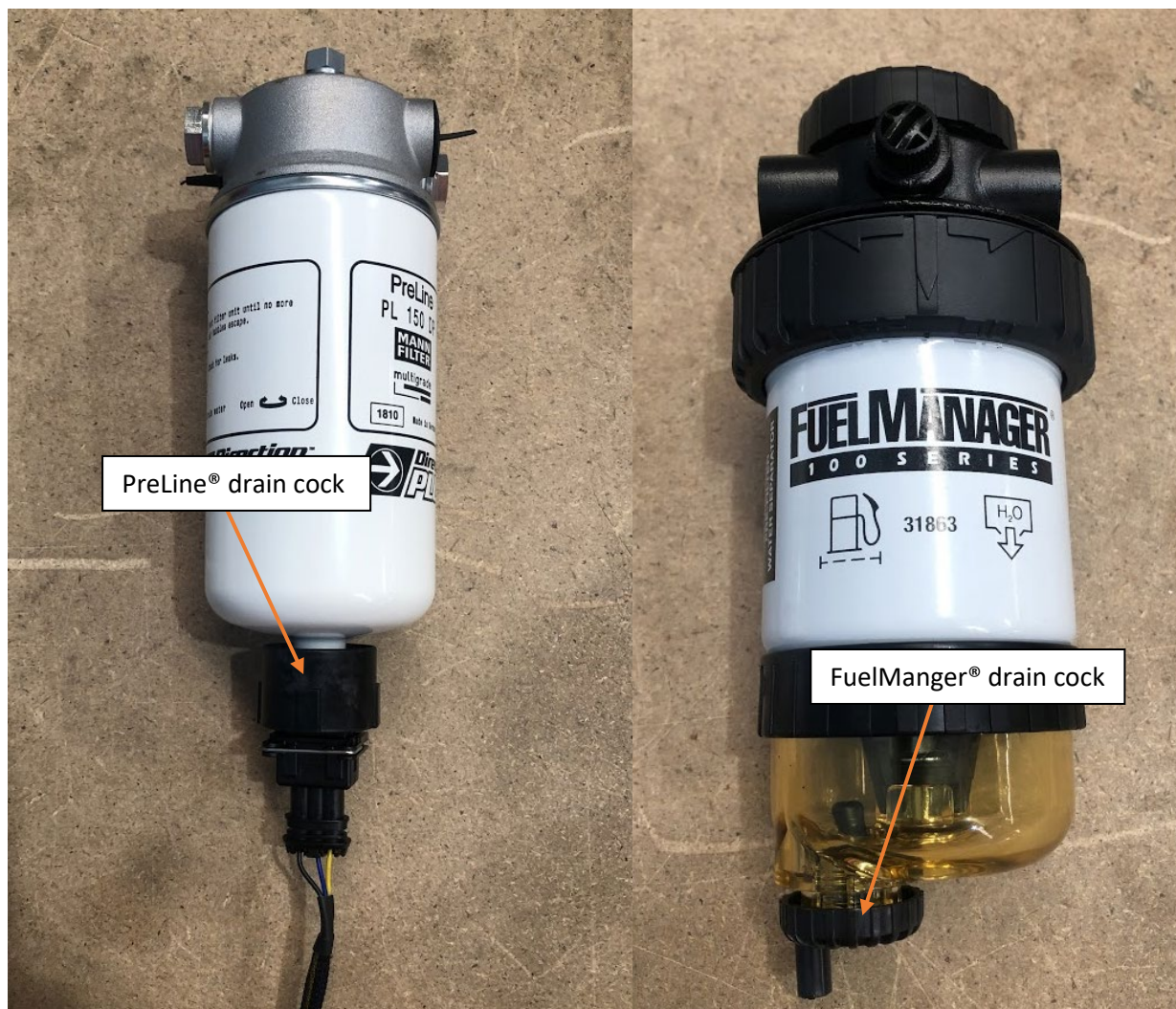
Location of drain cock